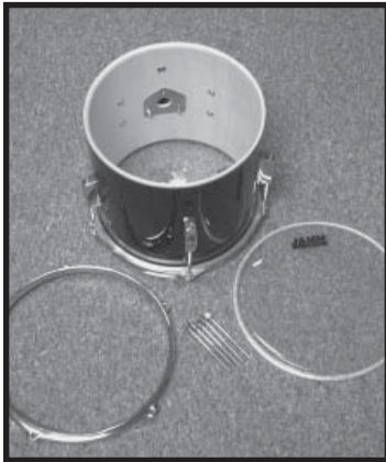
Tom Parts Shell Hoops Heads Tension Rods