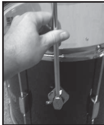
After building your floor tom turn the floor tom upside down (notice the leg mounts should be close to you) slide the legs into mounts then tighten.