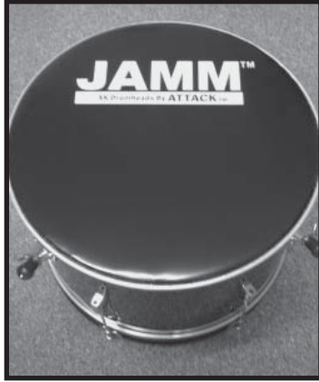
Place the top drum head to the drum shell