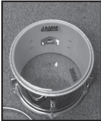
Place the top drum head to the drum shell