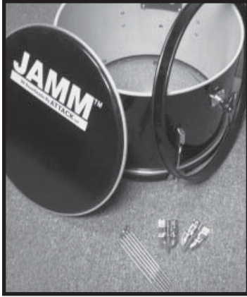
Bass Drum Parts Shell Hoops Heads Claws & Tension Rods