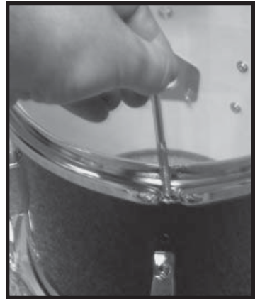
Take your tom tension rod and loosely put in the tension rod. Once you have placed all tension rods in place tighten using a star pattern. Repeat for other side.