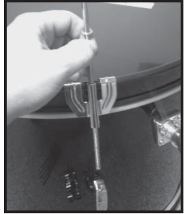
Take your bass drum claw and tension rod and place it over the bass drum lug and loosely put in the tension rod. Once you have placed all your claws and rods in place tighten. Repeat for other side.