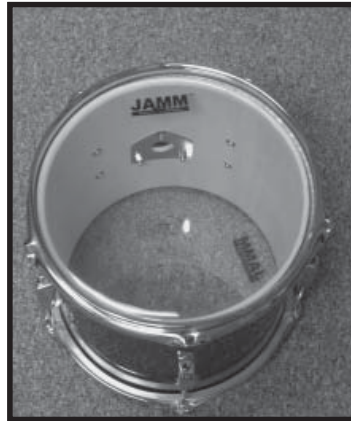
Fit the rim on top of the drum head-placing it over the drum lugs.