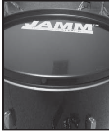
Fit the hoop on top of the drum head-placing it evenly around the drum head. Notice: The head with logo is the front head.