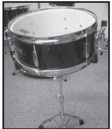
Place your snare drum onto the snare stand. Adjust the stand to fit the snare drum then tighten.