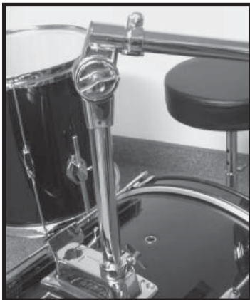
Insert the long end of the tom holder into the bass drum mount. Then tighten the wing nut. Using the joint of the tom holder you may adjust the position of the tom drum. Repeat process for other side.